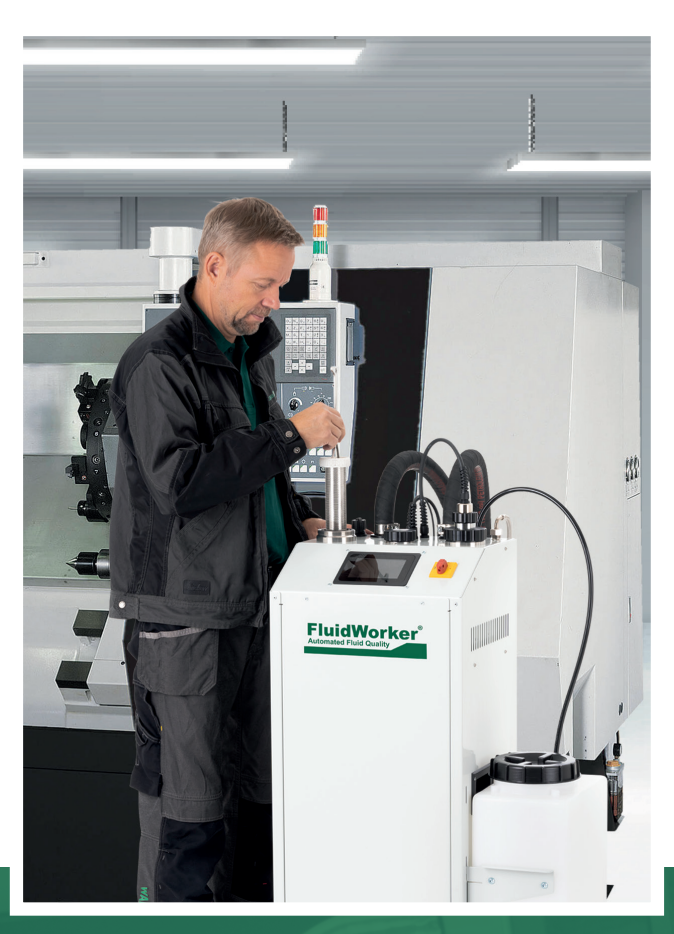
Fluid management automated by FluidWorker 150