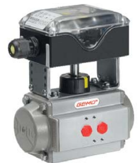
GEMÜ LSC with DR/SC actuator