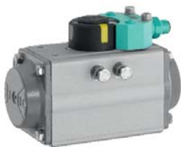
GEMÜ LSF with DR/SC actuator