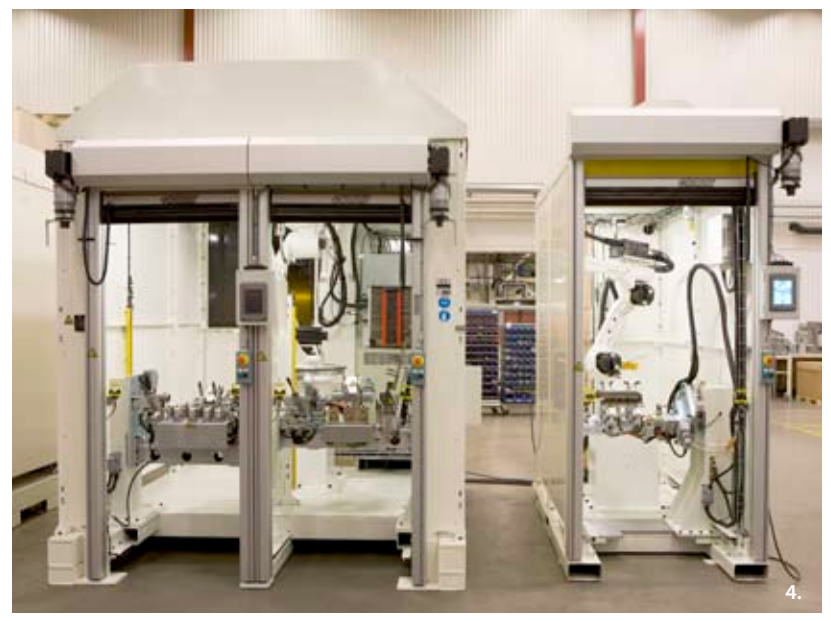
Long experience in automation makes for simple solutions with function in focus. 1. Robotic welding fixture on trolley for easy fixture replacement. 2. Spot welding machine. 3. Electrical forming machine. 4. Double/single robot welding cell, built on foundations for easy handling by forklift.