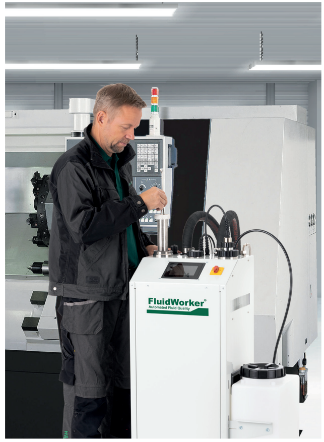
Fluid management automated by FluidWorker 150