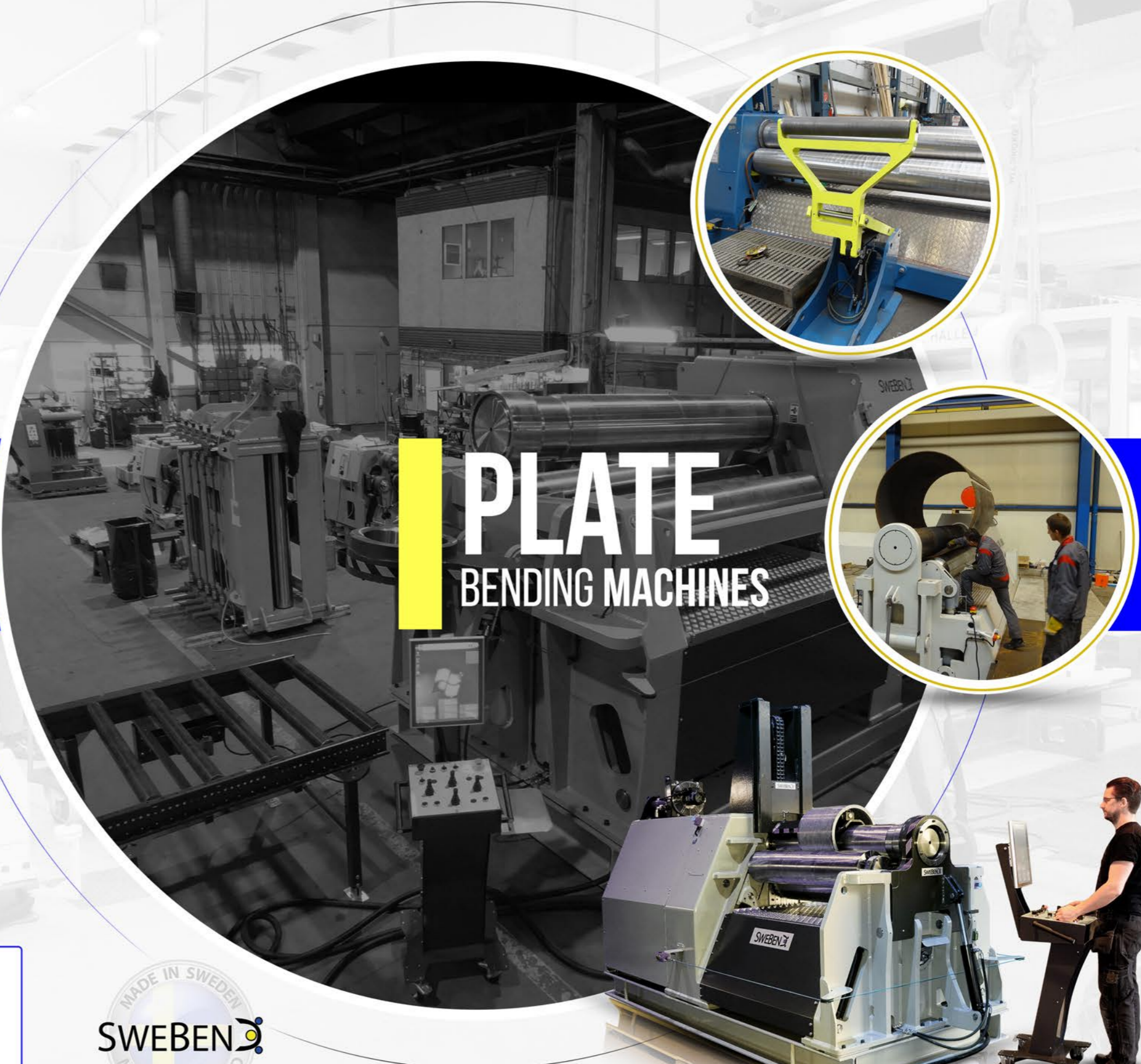
PLATE BENDING MACHINES