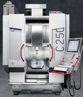
C 250 U