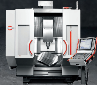
C 42 U