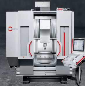
C 32 U