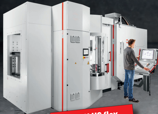
C 42 U HS flex