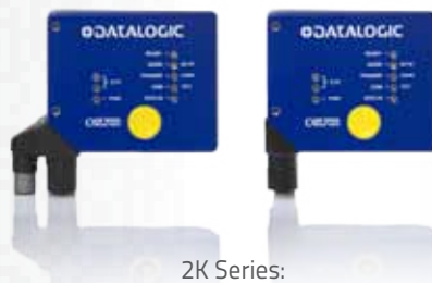
2K Series: DS2100N DS2400N