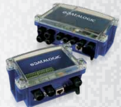
AL5010 INTERFACES MODULE