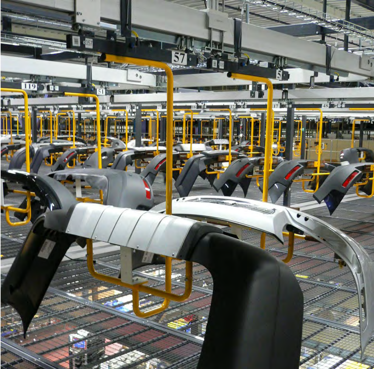
Buffer of bumpers on mezzanine to increase floor space utilization. OCS DC (Digital Control) select bumpers in correct sequence.