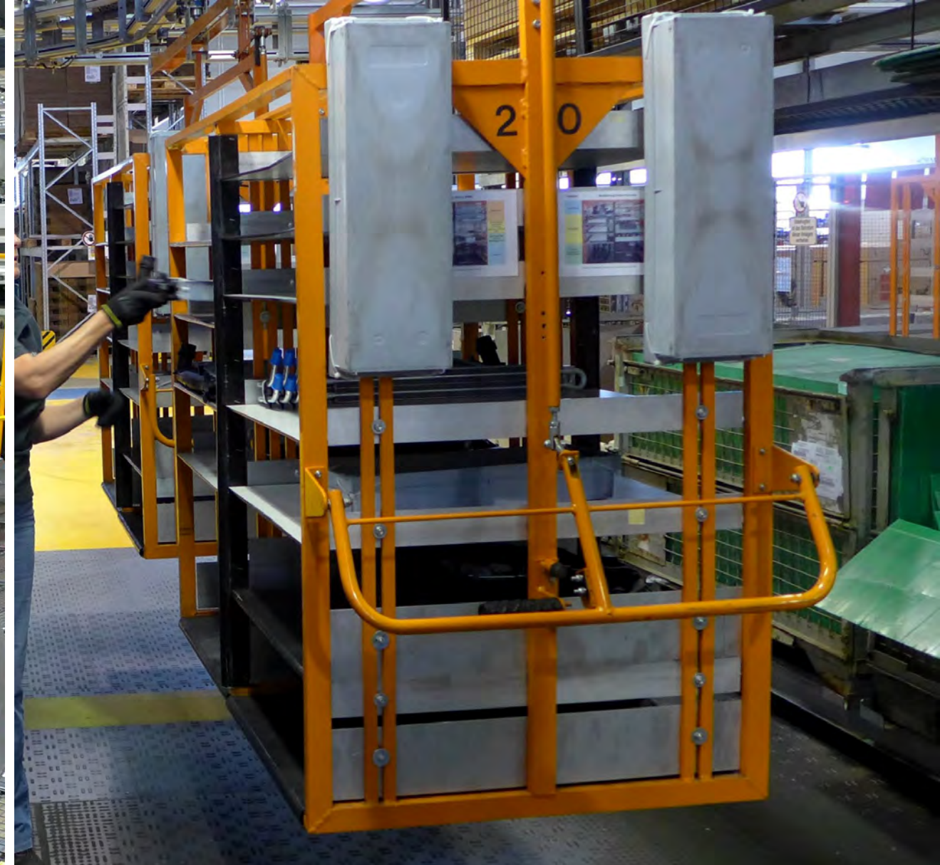
Carrier optimized for kitting. Dedicated positions for each part increase visual verification. OCS DC (Digital Control) can support the kitting process with e.g., "Pick-to-light" system.