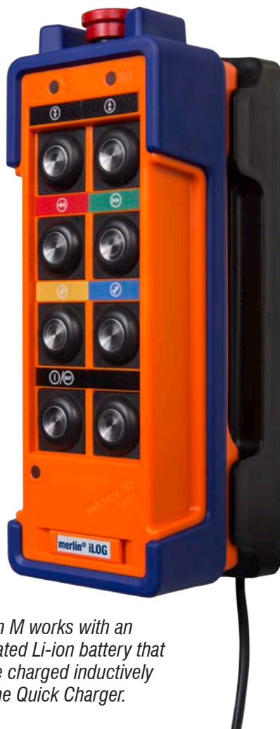
micron M works with an integrated Li-ion battery that can be charged inductively with the Quick Charger.

Today, our transmitters orbit, micron M, technos 2, technos A, technos B and spectrum E are already equipped with this powerful technology. We are also working on a move to Li-ion batteries for other renowned products. For example, the radio transmitters spectrum 3 and spectrum D will soon be available with a new Li-ion exchange battery.