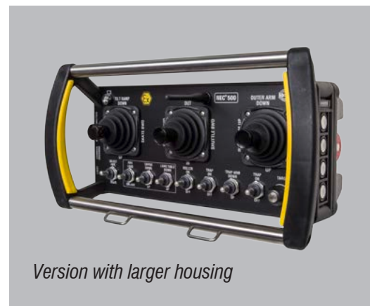
Version with larger housing