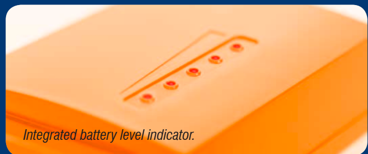
Integrated battery level indicator.

For charging the new battery types, the new battery charger QD40500 is available for both batteries and will work with DC or AC power (additional plug-in power supply required for AC use).