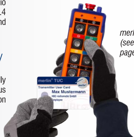
merlin® TUC (see report on page 4 / 5)

These safety features can automatically deactivate the radio control in dangerous situations and thus offer additional protection for the operator.