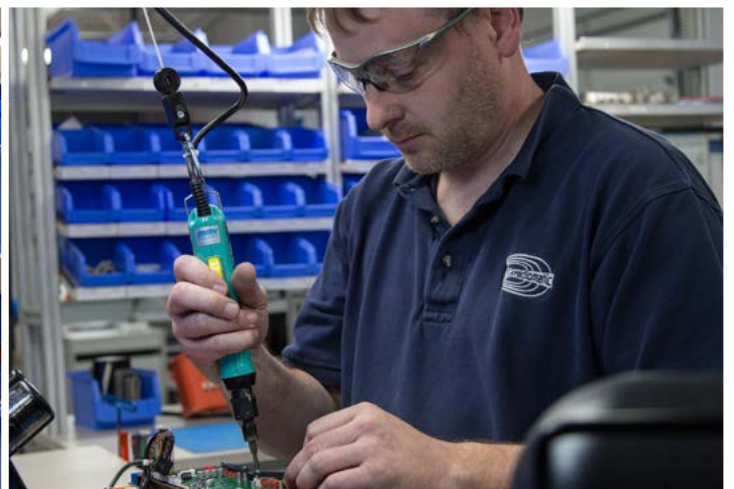
An experienced team of technicians provides quick service repairs minimizing downtime.