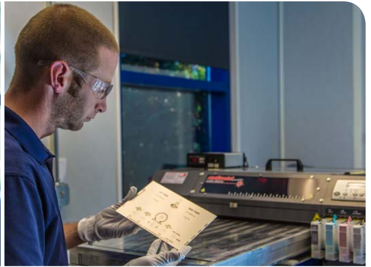
Transmitter front panels are designed individually to fit to the customer's requirements.