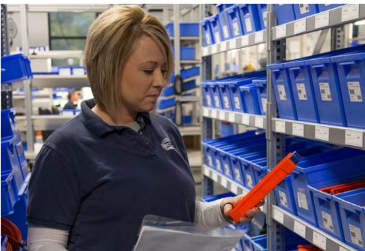
A well-stocked spare parts and accessory warehouse ensures quick availability and short delivery times.