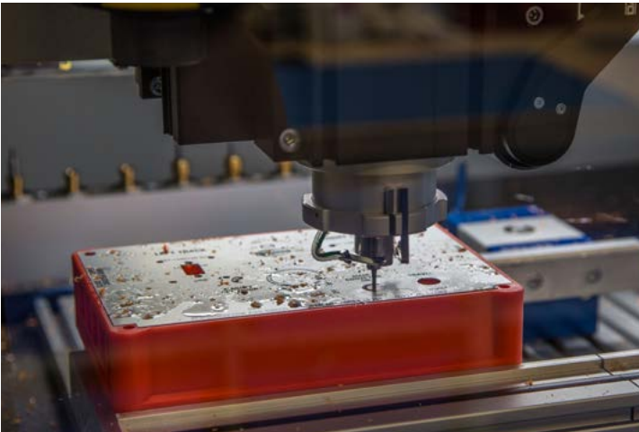
Modern CNC machines are used at HBC-radiomatic, Inc. to modify the transmitter housings.