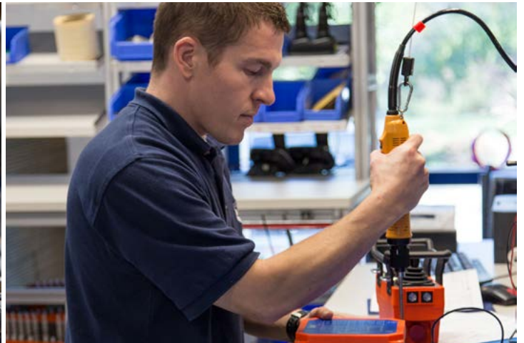
The systems are assembled in the production islands. All functions of the radio system are tested here before delivery.