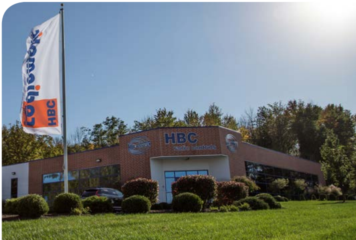
HBC-radiomatic, Inc. in Hebron (Kentucky, USA).

Today we would like to present our subsidiary in a photo series: