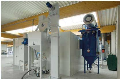
Blast installation, blasting media recycling system and dust extraction installation