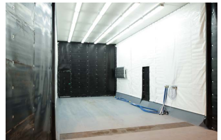
White tarpaulin and dustproof, high efficiency lighting on the inside