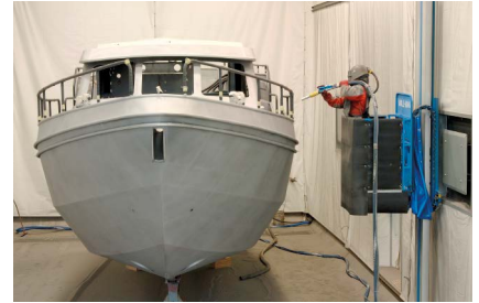
Movable platform for operator