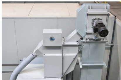
Cleaner with powered vibrating sieve